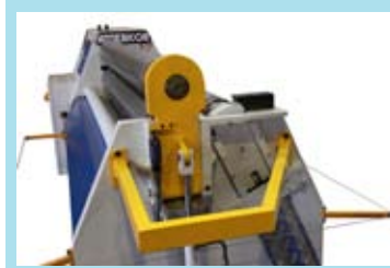
Model 3RSP 3-Roll Single Initial-Pinch

These machines offer the most complete line of "standard" bending rolls and the option to add productivity enhancements while maintaining competitive prices and timely deliveries (most often from stock).