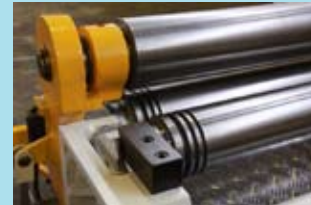
Optional grooves for 1/4", 3/8" and 1/2" rounds