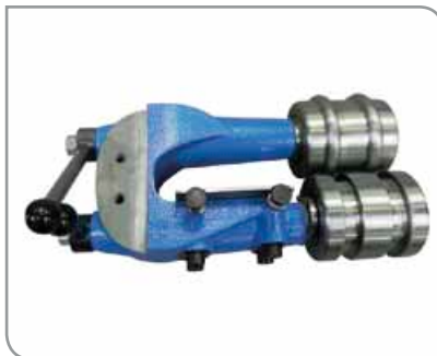
Corrugating Unit No. 2C