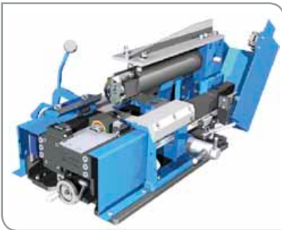
Slitter Model H