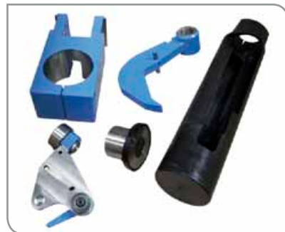
Heavy Duty Tooling Kit v2.0