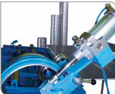
PLC Corrugation Unit