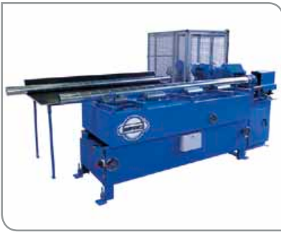
SSC - Spiro® Speed Carrier