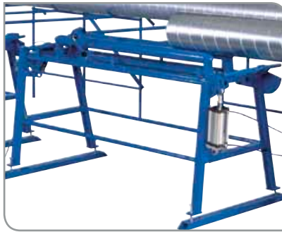
Standard Run-off Table