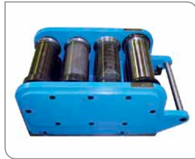
Form Roll Unit FRU