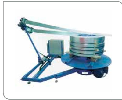
Horizontal Decoiler DCH-3000