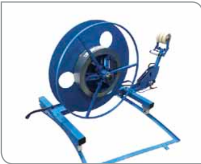
Vertical Decoiler DCV-1000