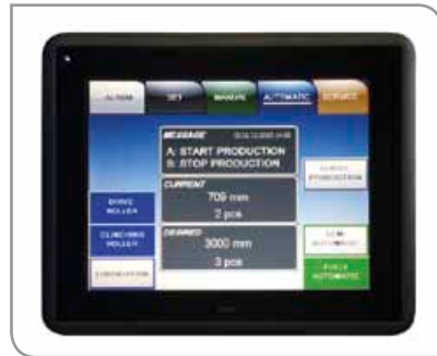
State-of-the-art User Interface