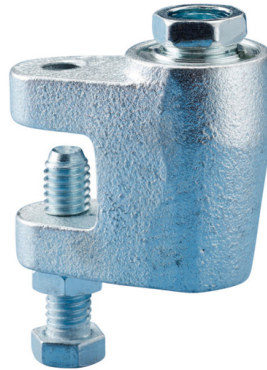
CADDY ROD LOCK Beam Clamp, Thick Flange