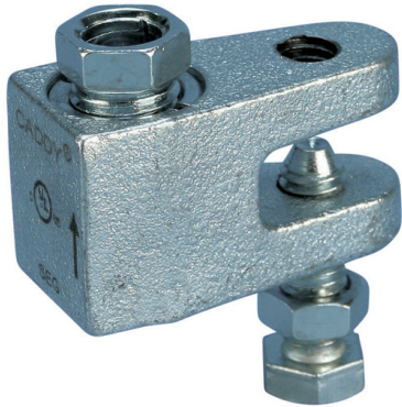
CADDY ROD LOCK Beam Clamp