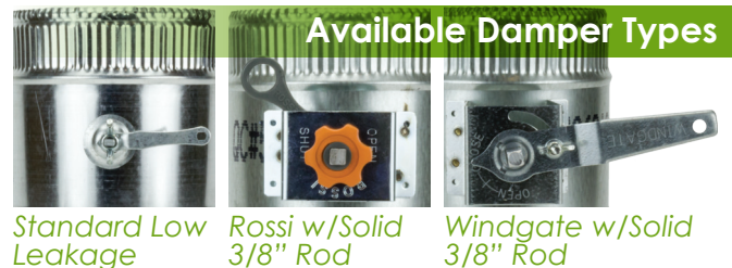
Standard Low Leakage

** 2 piece collar provided on Aluminum and Stainless Steel.