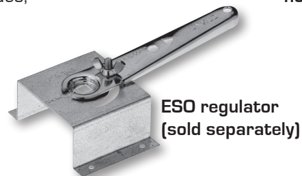
ESO regulator (sold separately)