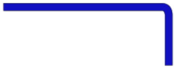
Right Angle Flange (also referred to as male Pittsburgh)