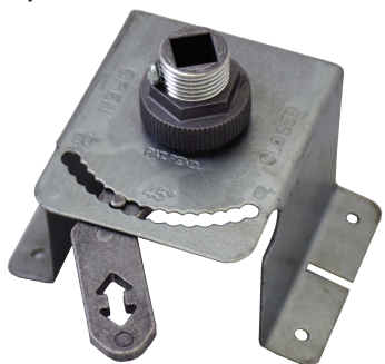
Also available with a Cast Metal Handle!

10° angled stand to accommodate both square and round duct