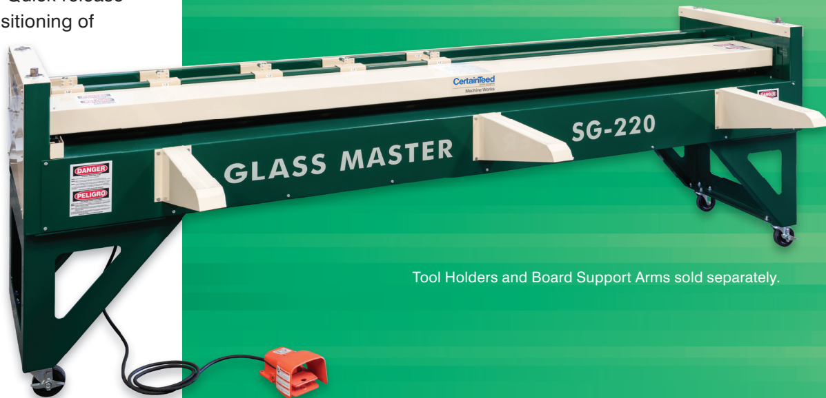
Tool Holders and Board Support Arms sold separately.