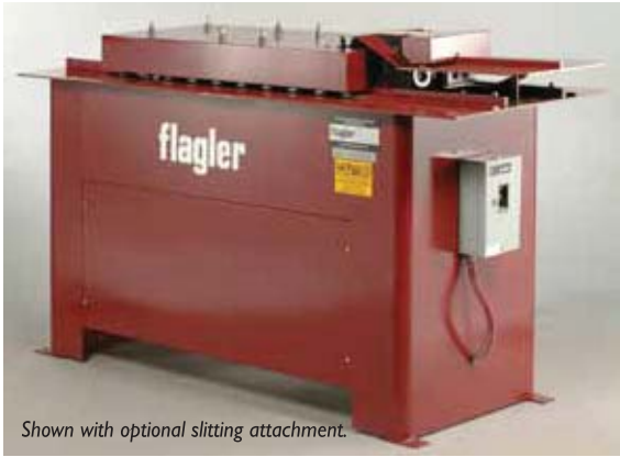
Shown with optional slitting attachment.

The Quadformer machine is standard with Reinforced "S" Cleat (22-28 Ga.) and 1 1/8" Drive Cleat Rolls (20-28 Ga.) mounted inboard and 2 sets of extended shafts for auxiliary tooling. Add the optional head mounted Quad-Cutter attachment for slitting blanks for the "S" and Drive Cleats.