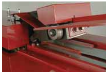
Optional Pivoting Head Quad Cutter Attachment (24 gauge max.) for slitting blanks for "S" and Drive Cleats. Cutter-head disengages for running pre-cut blanks.