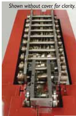
Shown without cover for clarity.

Dimensions: 74" long x 34" wide x 48" high