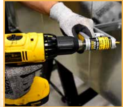
Installs into a standard drill