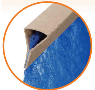
Pinch Frame Design