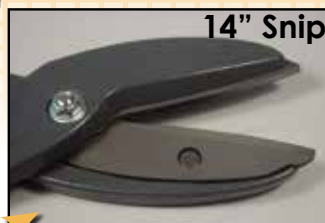
Easy and quick blade replacement