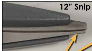
12" Snip Extended blade tip

Half the weight of comparable forged snips. Sleek head design allows material to easily flow over snip while cutting. Slim nose ideal for making cuts in tight places and reaching corners. Handle rings designed for added comfort and greater cutting leverage. Designed to cut up to 22 Ga cold rolled steel. Available in 12" and 14".