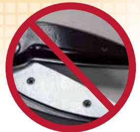
(No screws or rivets)