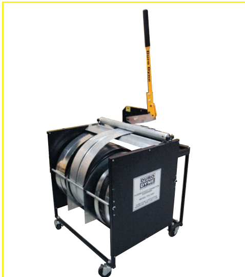
ITEM# 43008 FDCAB3 WITH SHEAR

For safety, the FDCS-10 has a safety pin to lock the shear in the open position and hold the 30" long handle upright and out of the way.