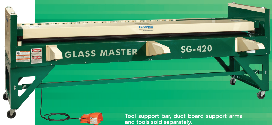
Tool support bar, duct board support arms and tools sold separately.