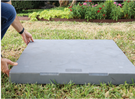
Textured surfaces for added traction

Created to replace heavy, expensive, time and labor consuming concrete pads, the POLARPAD can be installed in minutes with no extra equipment required.