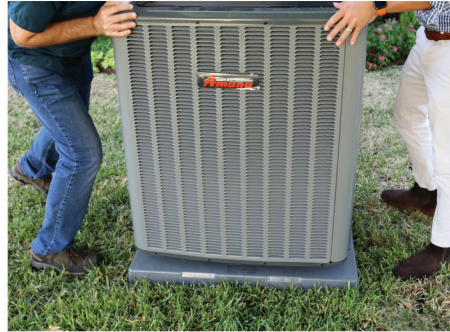
Reinforced ribbing provides structural support