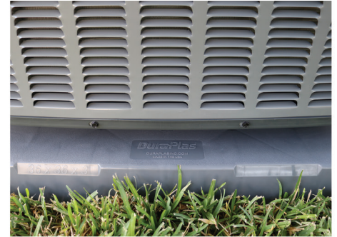
Ultra Light / Ultra Strong Concrete Alternative