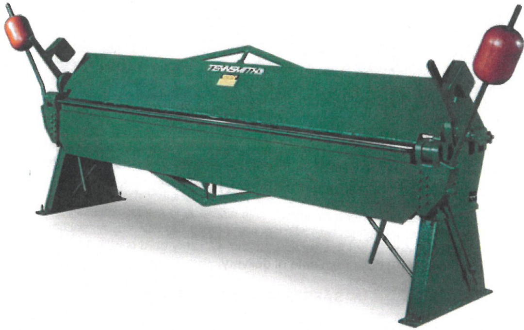
Model HB121-16 Shown

MODELS HB73-16 HB97-18 HB97-16 HB97-12 HB121-18 HB121-16 HB121-14 HB145-18