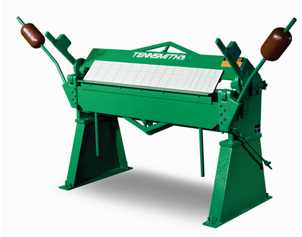
Model HBU48-12 Shown